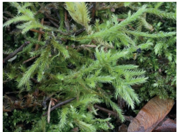
Brachythecium salebrosum, Micheldever Wood 19 January 2023.

I reported on some interesting finds in Gosport in the last issue of Flora News , and since then have added three more species of interest (two being new for the county) and submitted a further voucher as a VC11 debracketer.