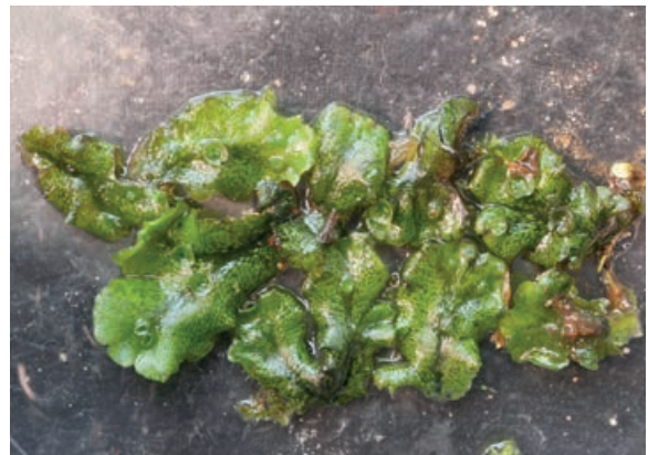
Marchantia polymorpha subsp. polymorpha specimen from Castle Bottom NNR.