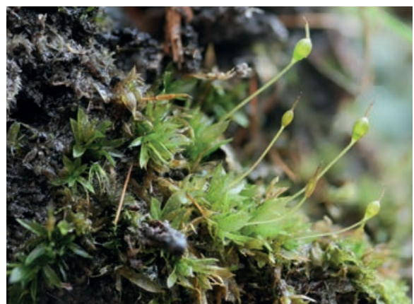
Entosthodon obtusus , Castle Bottom NNR, 21 January 2023. Jonathan Sleath