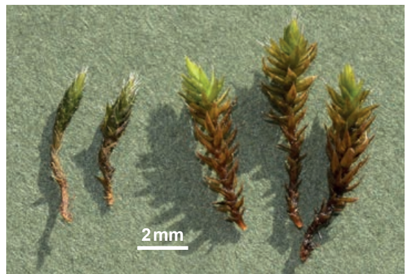
Grimmia laevigata, Workhouse Lake, Gosport. Top to bottom: colony in dry state; colony moistened; comparison of dry and wet shoots; February/March 2023.